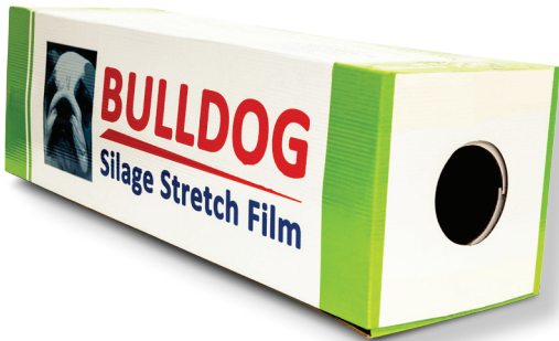
BULLDOG Silage Film

70% stretch | UV stabilised | Plastic core | Light green 25um